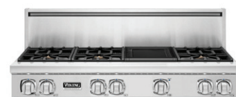
48" W. Gas Rangetop with griddle

Shown with optional accessory 10"H. backguard