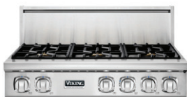
36" W. Gas Rangetop