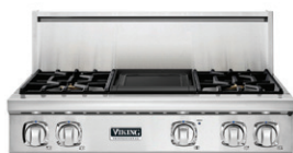
36" W. Gas Rangetop with griddle