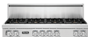
48" W. Gas Rangetop