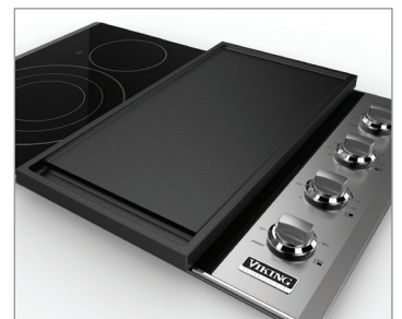
Optional Griddle Accessory