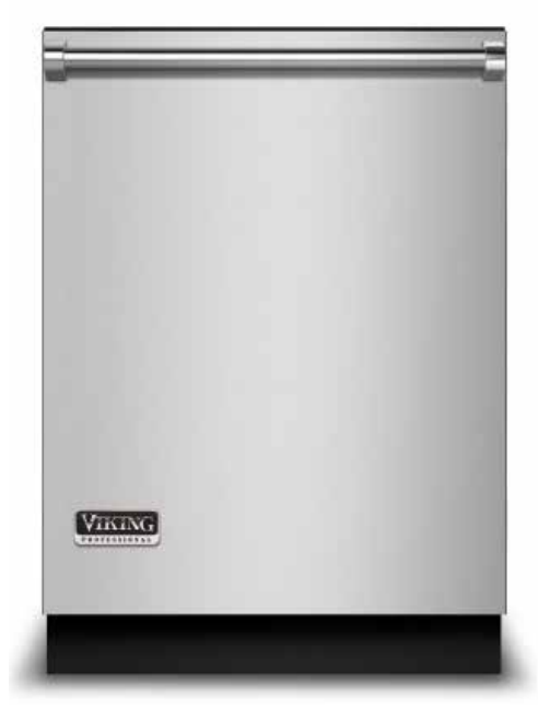
24" Wide Dishwasher