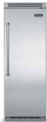
30"W. All Freezer