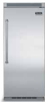
36"W. All Refrigerator