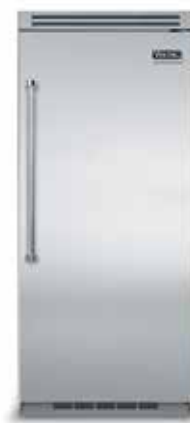
36"W. All Freezer