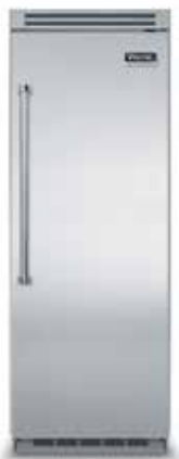
30"W. All Refrigerator

Viking Professional built-in refrigeration offers cold storage options in a range of configurations that fit perfectly to your functional and styling desires. These professional quality refrigerator/freezers provide the ultimate in cold storage, with dedicated drawers and shelves to accommodate every item on your grocery list. Have your Viking Professional refrigerator blend seamlessly into cabinetry with custom panel options, or further adorn your refrigerator by choosing from one of our 12 exclusive finishes.