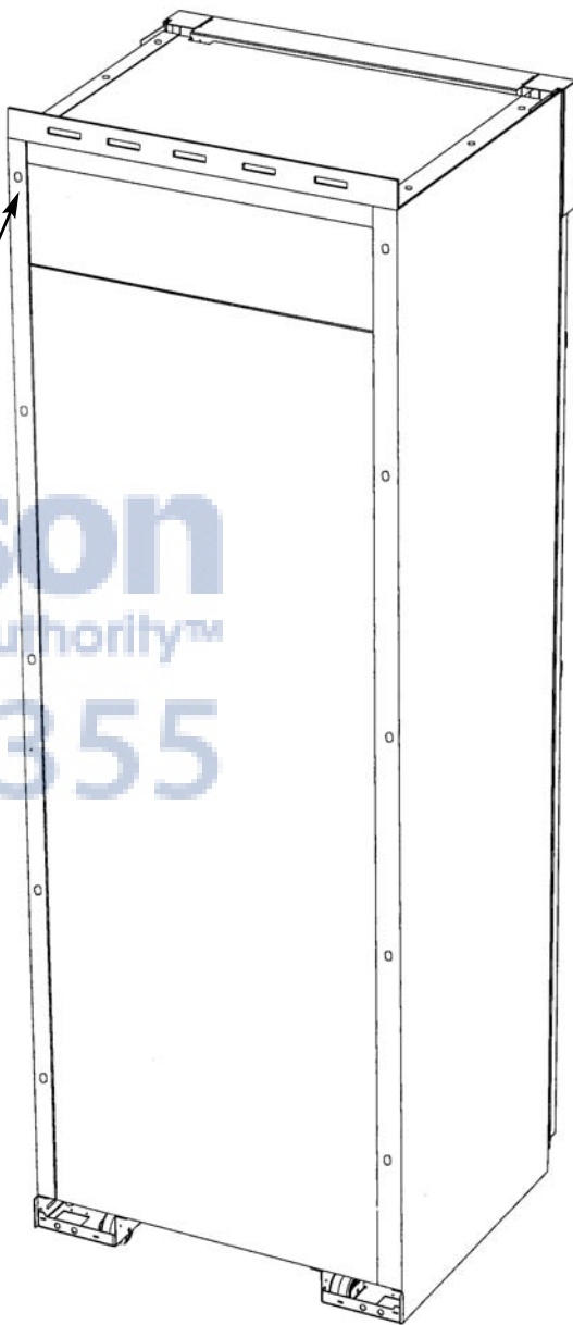
Figure 2 (Rear of unit)

VIKING 111 Front Street • Greenwood, Mississippi 38930 USA • (662) 455-1200