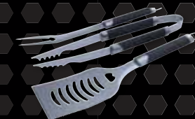
55040 Tool Set