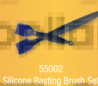
55002 Silicone Basting Brush Set

For a complete line of ULTRA CHEF accessories, visit ultrachefgrills.com