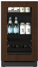
URBV418-IG01A Integrated Frame Glass