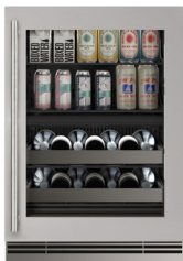
URBD324-SG01A Stainless Steel Frame Glass