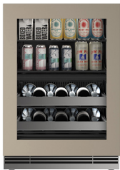
URBD324-IG01A Integrated Frame Glass