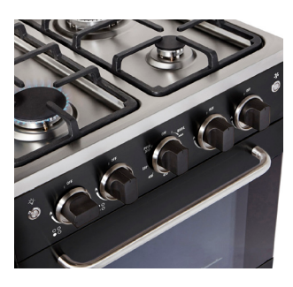
Modern knobs designed for cooktop & oven