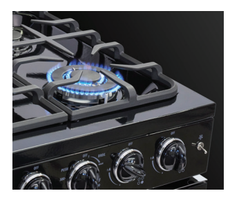
Zinc cast handles & chrome finished trims

Modern knobs designed for cooktop & oven