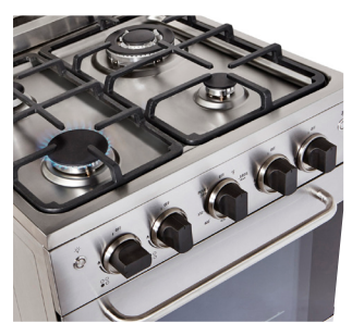
Modern knobs designed for cooktop & oven