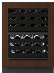
URWD424-IG01A Integrated Frame Glass