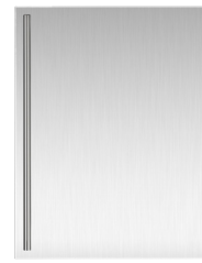
ULASBPGLOSS24 (Frame) ULASBPSOLID24 (Solid) Stainless Steel Door Wrap with Classic Bar Pull