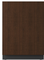
URWC424-IS01A Integrated Solid