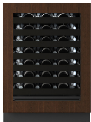
URWC424-IG01A Integrated Frame Glass