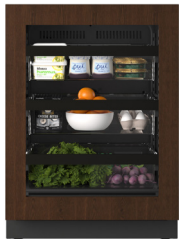
URRE424-IG01A Integrated Frame Glass