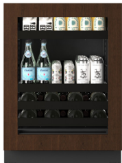
URBV424-IG01A Integrated Frame Glass