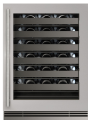
URWC324-SG01A Stainless Steel Frame Glass