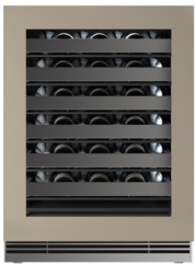
URWC324-IG01A Integrated Frame Glass