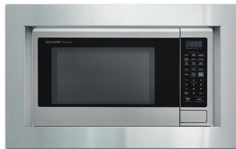
RK56S27F and RK56S30F