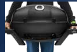
Side Handles for Easy Carrying