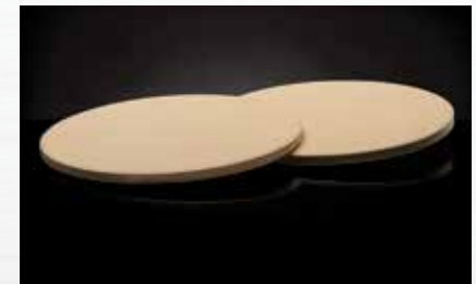
10. PERSONAL SIZED PIZZA / BAKING STONE SET