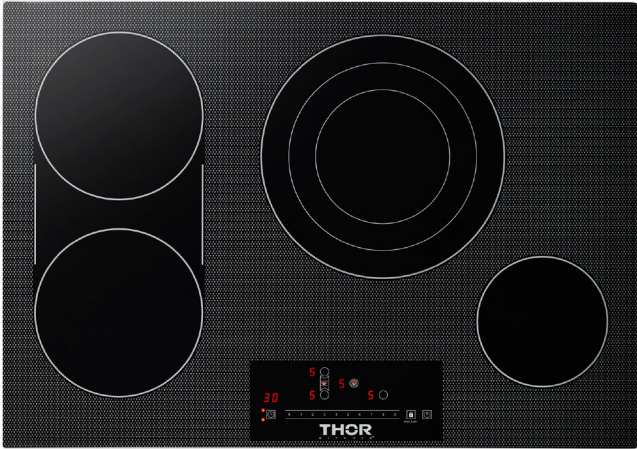
Product: 30 Inch Professional Electric Cooktop