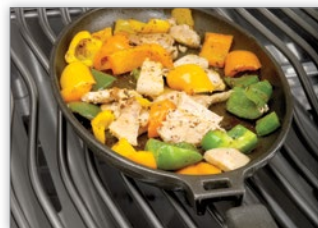
Professional Cast Iron Skillet 56003