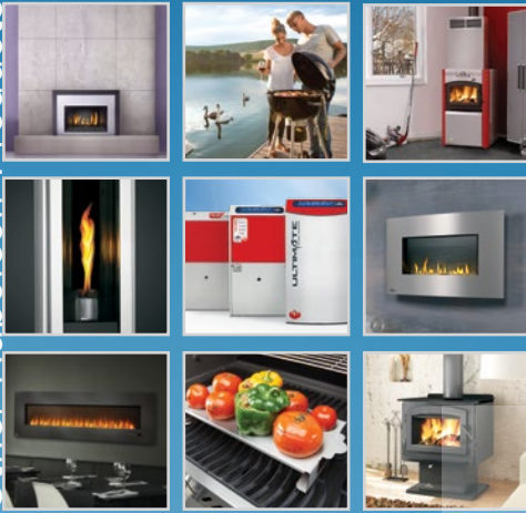
Fireplace Inserts • Charcoal Grills • Hybrid Furnaces • Outdoor Fireplaces Gas Furnaces • Gas Fireplaces • Electric Fireplaces • Accessories • Wood Stoves