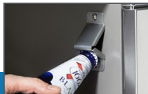
Integrated Bottle Opener