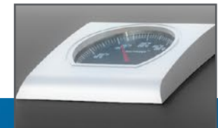
ACCU-PROBE™ Temperature Gauge