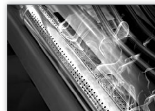
Smoker Pipe 67011