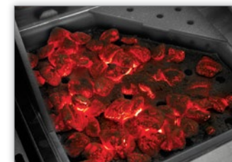
Charcoal Smoker Tray 67731