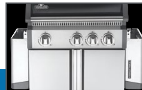
Folding Side Shelves