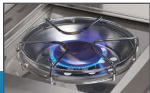
Range Side Burner