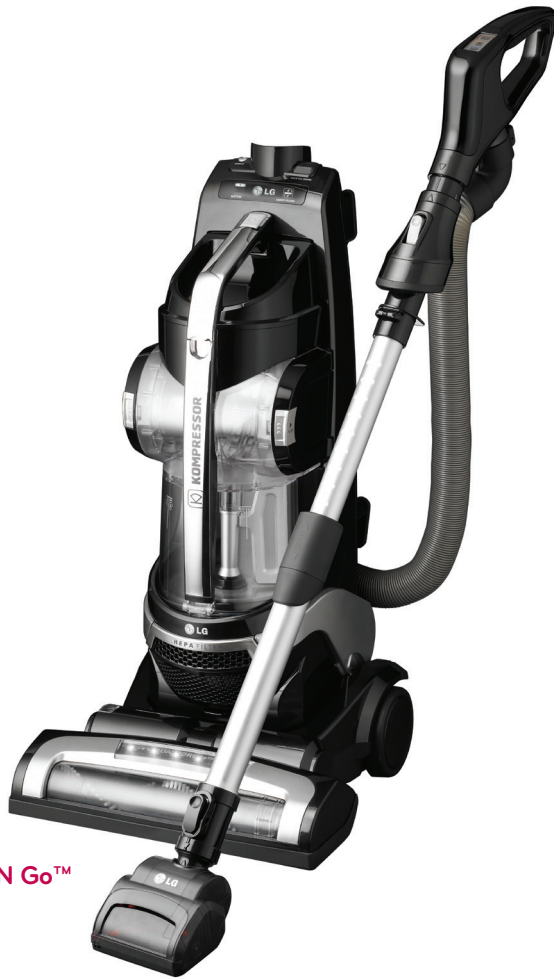
Click 'N Go™ Wand