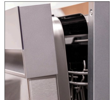
The Auto Door Open feature provides quick and effective drying, especially ideal for plastic items.

SHARP ELECTRONICS CORPORATION 100 Paragon Drive, Montvale NJ, 07645 1.800.237.4277 • www.sharppusa.com