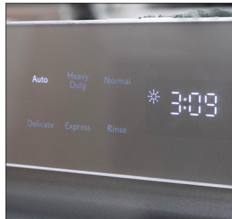
Adaptive Option Indication using the back lit control panel shows you available options for each washing cycle.