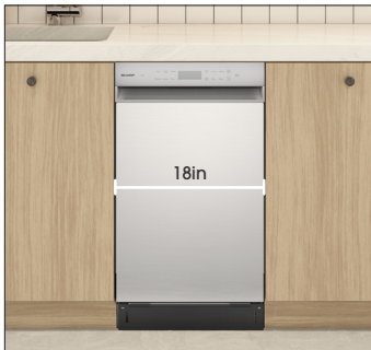
A sleek design with Fingerprint resistant Stainless Steel door.

The powerful and versatile features of this premium dishwasher give you more than peace of mind. Designed with space saving in mind, the Sharp SDW4523MS gives you peace and quiet at a serene 47dB. Balance and Harmony. Exceptional Quality. The SDW4523MS Stainless Steel Dishwasher from Sharp is a perfect fit for your compact kitchen.