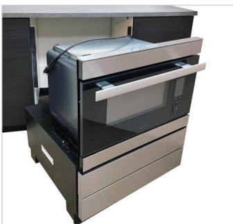
Optional, 2-drawer Pedestal slides into a standard dishwasher cutout for hassle-free installation.

Cleanup is a breeze with two preset cleaning modes. There is even a sterilize option for canning jars, small cutting boards, and utensils. The removable reservoir means no special plumbing or wet-wall installation is required. And with a common 120V power requirement, you can simply plug it into a regular outlet, and you're ready to go.