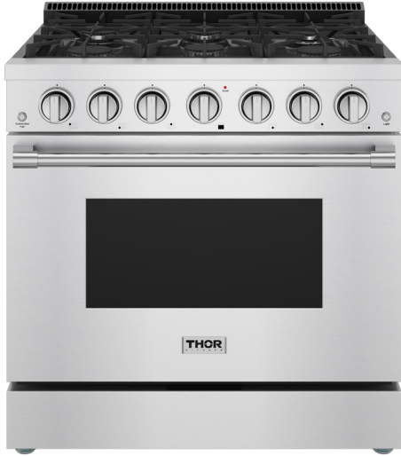
Product: 36 Inch Professional Gas Range Model Number: SRG3601/SRG3601LP