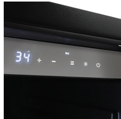
Seamless Capacitive Touch Controls