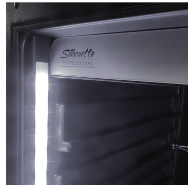
LED Perimetrical Lighting