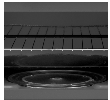
Recessed turntable with On/Off functionality creates an even cavity floor to accommodate cookware as large as 14" x 20"

SHARP ELECTRONICS CORPORATION 100 Paragon Drive, Montvale NJ, 07645 1.800.237.4277 • www.sharppusa.com