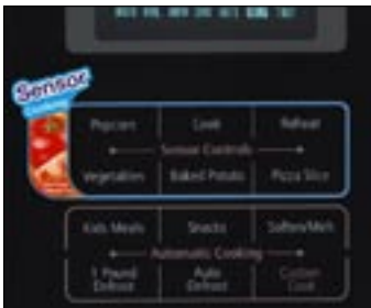
Sensor cooking and family-friendly presets make it easy to use.