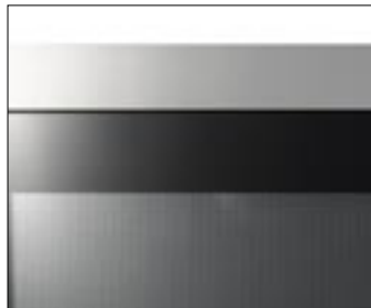
Stainless steel with a hidden vent provides a stylish look.