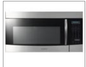
Stylish design complements other kitchen appliances.

Design and specifications are subject to change without notice. Non-metric weights and measurements are approximate.