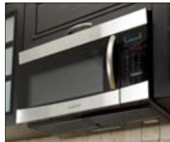
Samsung continues to lead in the development of over-the-range microwave ovens with this value-packed product.