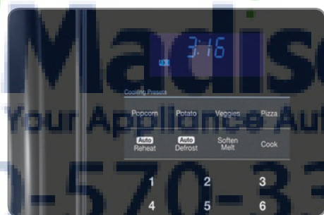
Features a blue digital LED Display – compliments any kitchen decor.