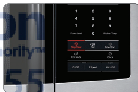
Digital touch control lets you easily program the desired cooking time and power.