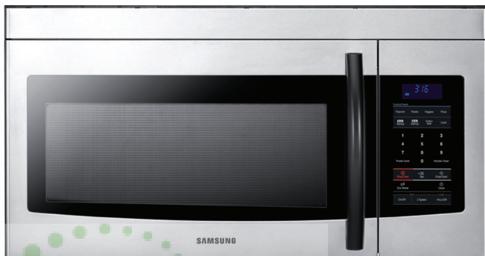
Stylish design compliments any kitchen decor and provides the high performance you expect only from Samsung.