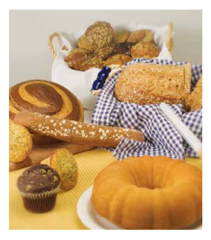
Low Mix combines convection heat with microwave power for perfect baking results. Use the Low Mix setting for baked goods that require more than 20 minutes baking time. Angel food and bundt cakes, quick breads and yeast breads and large muffins are examples of foods that bake perfectly at this setting. Check the use and care manual for further information.

Breads and cakes also turn out beautifully. The convection microwave team bakes bread with golden brown, crisp crust and fine texture. Cakes are tender moist and evenly cooked with a nicely browned surface. You can also bake two layers at a time rather than the one-at-a-time method of microwave-only baking.