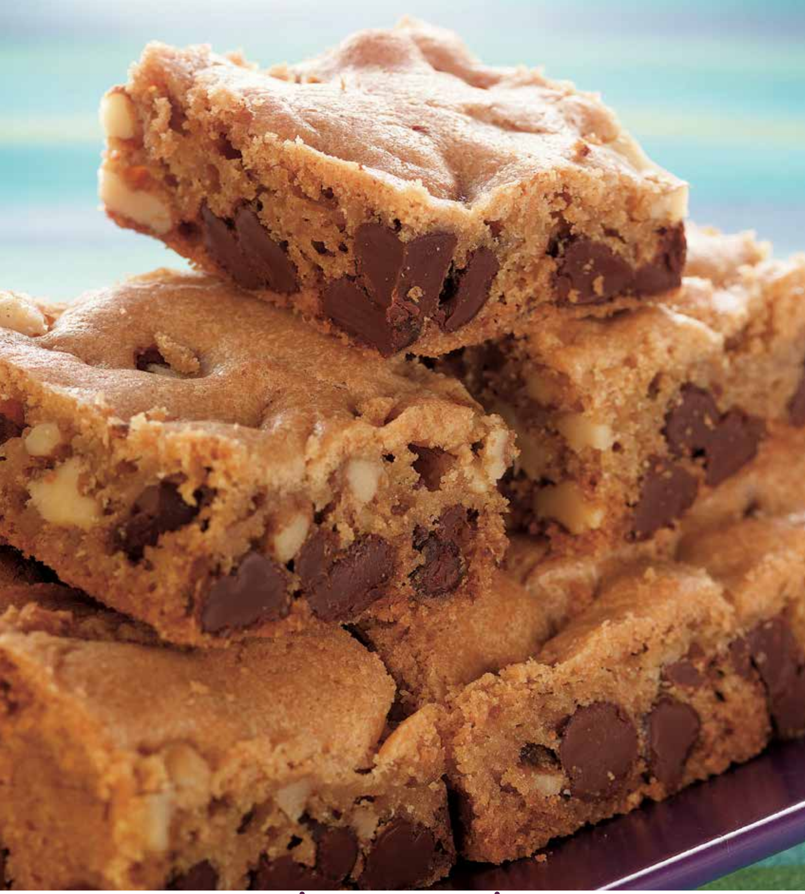
convection microwave baking & desserts