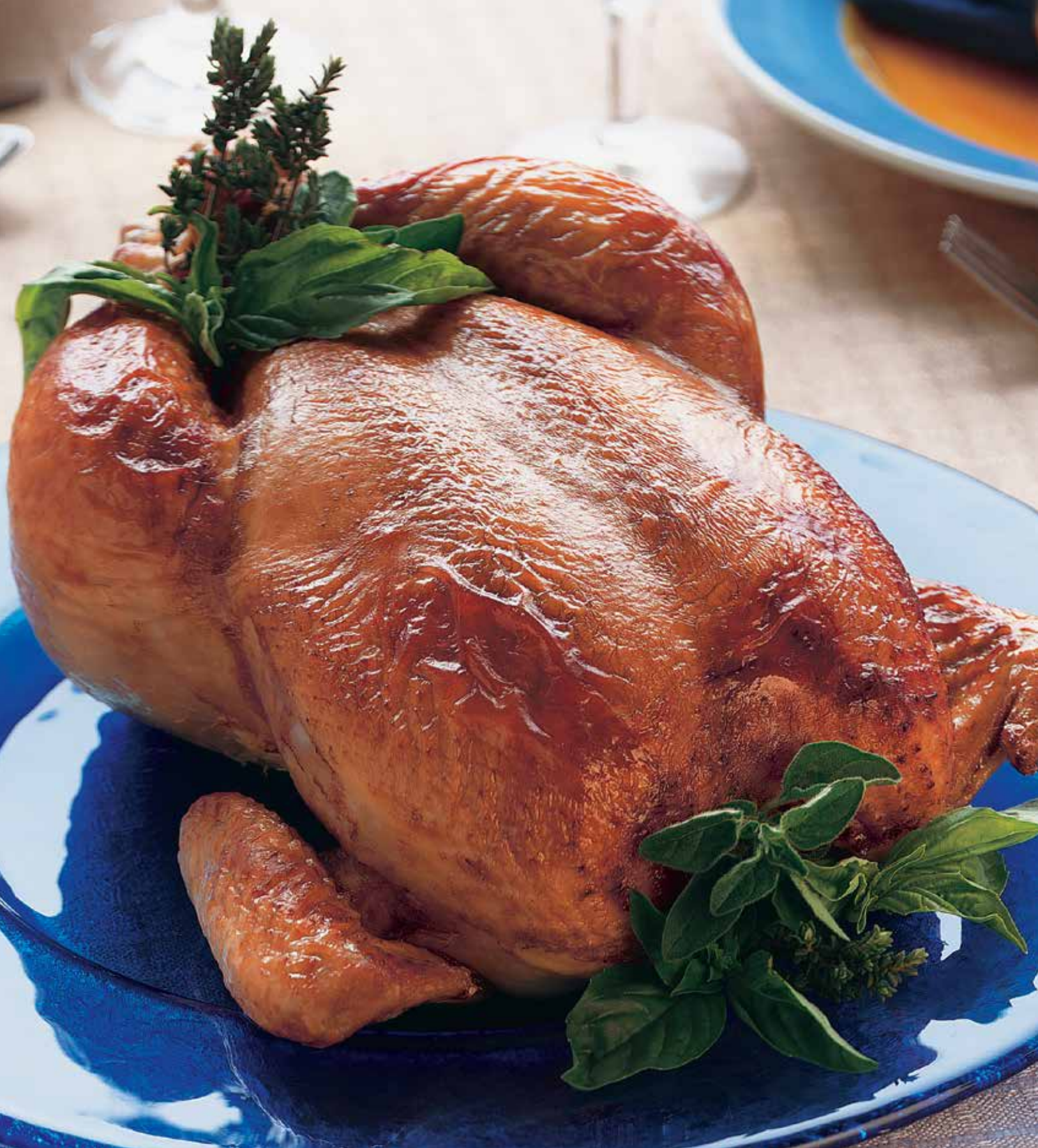
convection microwave main dishes