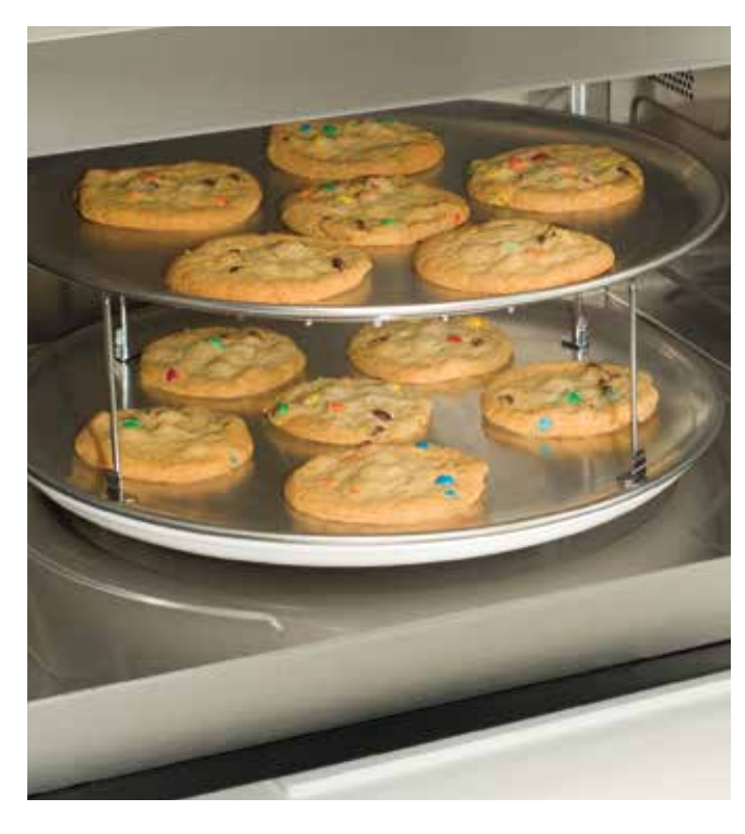
Two-Level Baking allows baking of two pans of cookies, small muffins or pizzas at the same time. Round baking pans are excellent cooking utensils for many convection-only items.