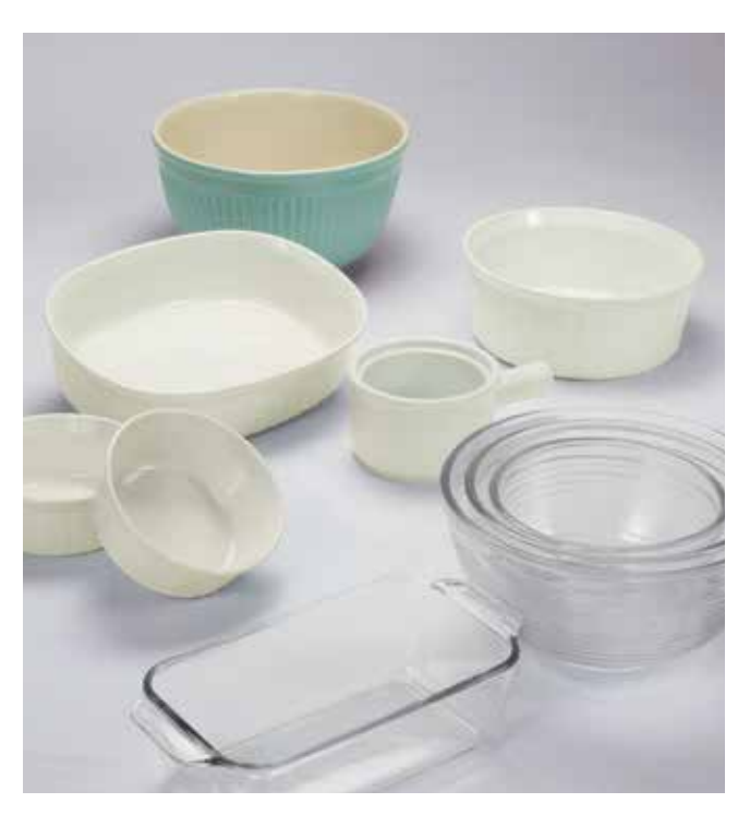
Oven glass is excellent for convection, combination and microwave cooking. Stoneware and pottery utensils may be used if they are also microwave-safe.