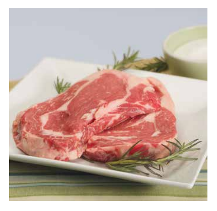
Check chart, opposite, for maximum broiling time. Program oven for maximum time, on BROIL or 450°F., following directions in use and care manual. Season and slash fat at 1-inch intervals. When audible signal sounds that oven is preheated, quickly put food in oven. You may also use Convec Broil.