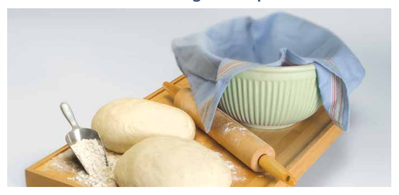
Proof dough. Use your own recipe or frozen dough. Place in well-greased bowl or loaf pan; cover with damp cloth. Place in oven at *SLOW COOK 100°F. 30 to 45 minutes. Frozen dough will take longer, 2 to 2¾ hours. Dough is doubled