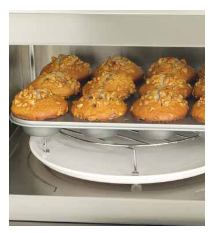
Turntable off is used for larger cookie sheets, 12-cup muffin pans and rectangular cake pans. Use low rack with turntable off. Convec Bake uses the turntable off for all selections.