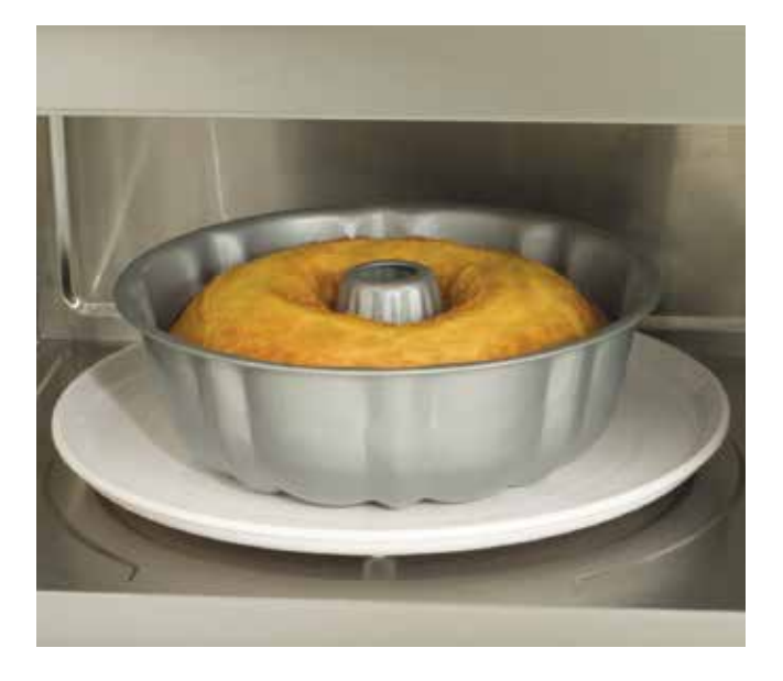
Tube or Bundt Cakes. Do not preheat oven. Bake cakes for three-fourths of time on recipe or package directions using LOW MIX. Bake cake on low rack. If arcing occurs with fluted tube pan, place a heat-and-microwave-safe dish or plate between pan and low rack.

Layer Cakes. Use a mix or your own conventional recipe. Use high rack and turntable to bake two layers at once. See chart on page 33.