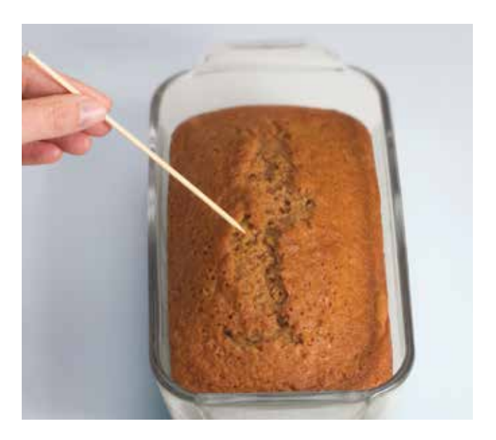
Loaf Cakes or Quick Breads. Do not preheat oven. Bake for three-fourths of time on recipe or package directions using LOW MIX. Test for doneness at minimum time. If loaf is not done, let stand in oven a few minutes to complete cooking.