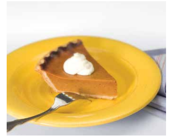
Frozen Prepared Custard-Type Pies. Preheat oven to temperature listed on package. Place pie on low rack. Bake three-fourths of package time using LOW MIX set at the package temperature. If filling is not set, let stand in oven to complete cooking.

Frozen Prepared Fruit Pies. Do not preheat oven. Bake on low rack. Use *HIGH MIX, 350°F. Bake 8-inch, 35 minutes; 9-inch, 40 to 45 minutes. (*Necessary to change temperature on HIGH MIX).