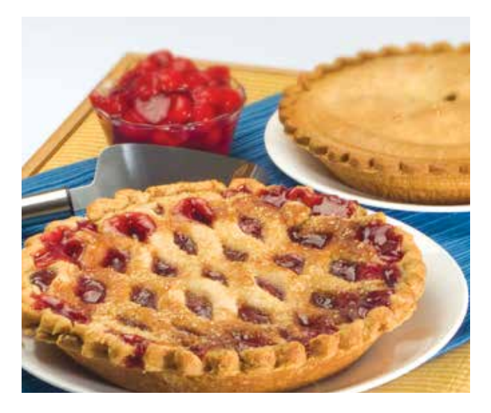
Double Crust or Crumb Top Pies. Preheat pie as you would for conventional baking; make slits in top of two crust pie. Preheat oven to 375°F. Place pie on low rack. Bake double crust or lattice pies 25 to 35 minutes on *HIGH MIX, 375°F.; crumb top pies 20 to 25 minutes on *HIGH MIX, 375°F. (*Necessary to change temperature on HIGH MIX).