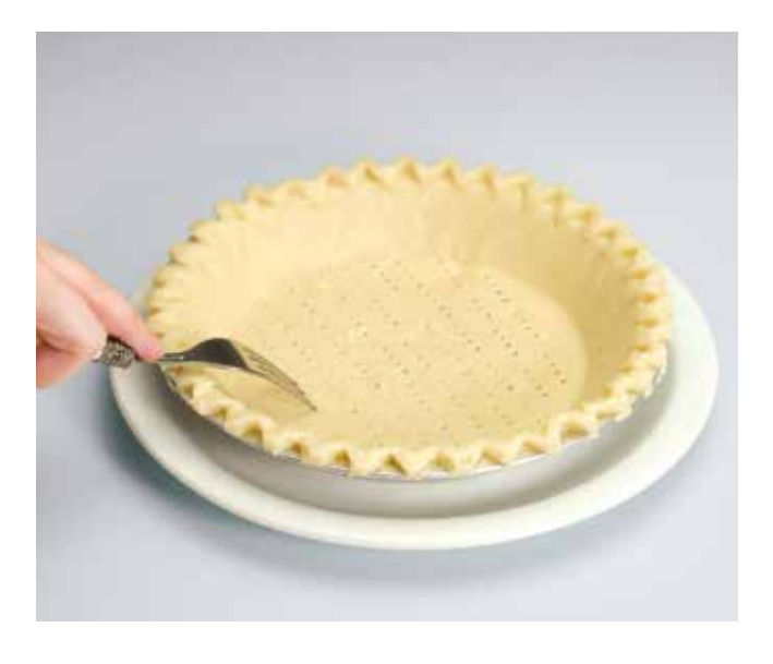
Pie Shell. Use mix, frozen pie dough or your recipe for single crust pie. Prick crust with fork. Preheat oven to 400°F. Place pie shell on low rack; bake with convection heat 8 to 10 minutes or until lightly browned. Cool and fill.