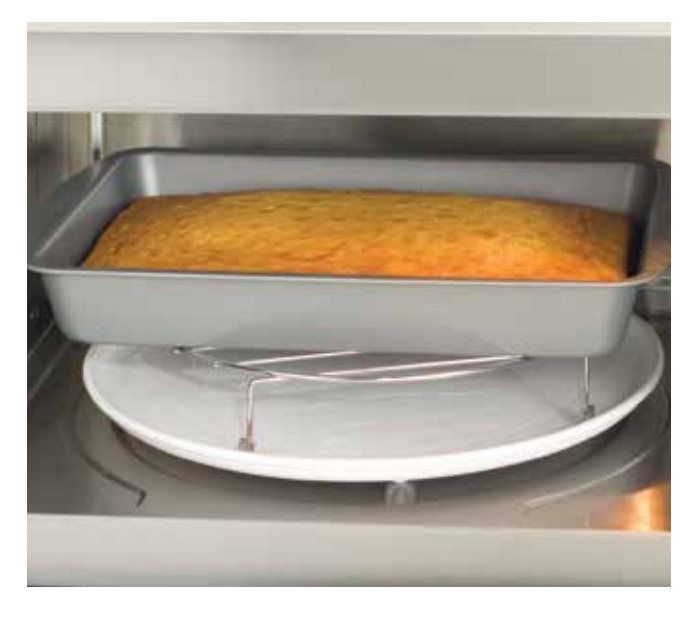
Rectangular Cakes. Use 13x9x2 baking pan and a mix or your own conventional recipe. Place pan on low rack. Use Convec Bake selection number 1.

Layer Cakes. Use a mix or your own conventional recipe. Use high rack and turntable to bake two layers at once. See chart on page 33.