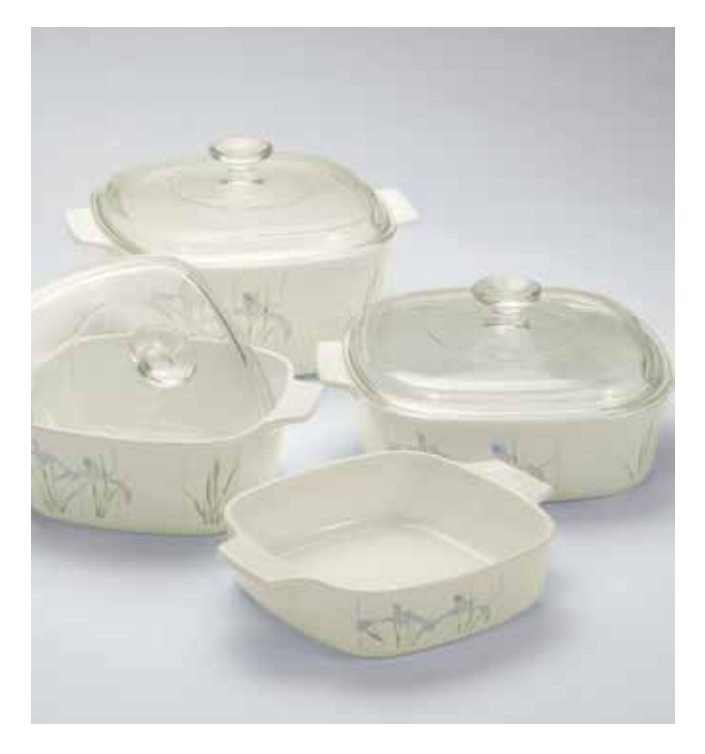
Glass ceramic (Pyroceram®) casseroles go from oven to table. They are microwave-safe and resist the heat of surface elements as well as ovens.