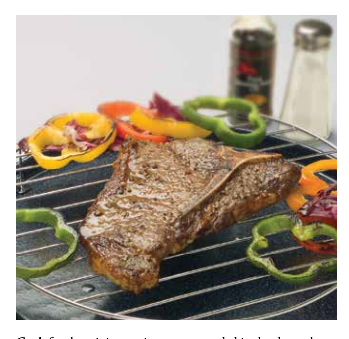
Cook for the minimum time recommended in the chart; then test for doneness. Time varies with the thickness or weight of meat and degree of desired doneness. Turning meat over is not necessary, as moving air cooks it on both sides.