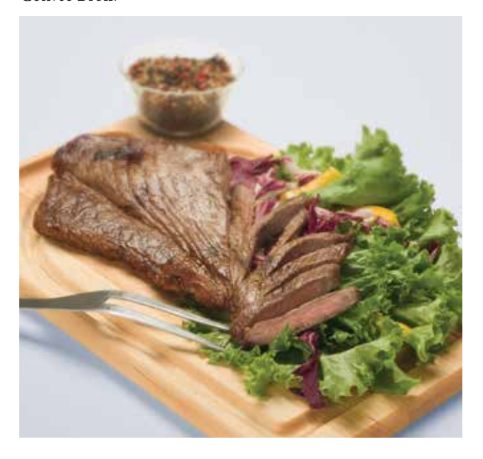
Broil food in advance, if desired, then slice. Individual servings may be reheated as needed by microwaving at MEDIUM (50%), until warm.