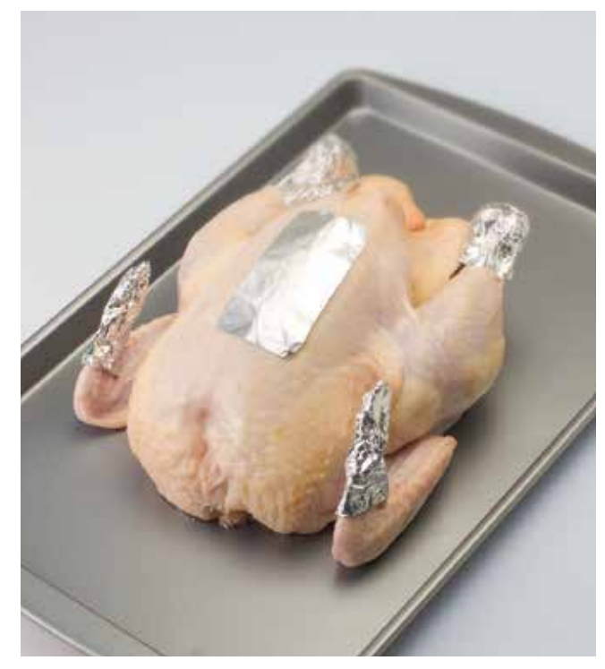
Shield thin or bony areas of roasts or breast, wing tips and legs of birds to prevent overbrowning. Be sure foil does not touch rack or oven walls.