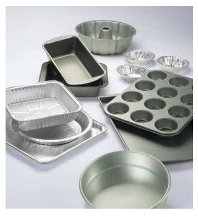
Metal and aluminum foil pans are safe for combination as well as convection cooking. During convection, heat transferred from the pan cooks the bottom and sides of food. During the microwave part of the cycle, energy penetrates from the top.