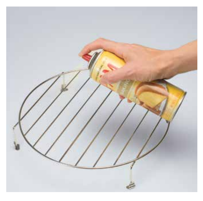
Spray low rack and turntable with nonstick vegetable cooking spray for easy cleanup. Do not cover low rack with aluminum foil, as it blocks the flow of warm air that cooks the food.