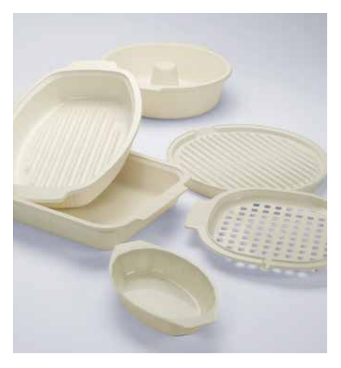
Thermoset * plastics are heat-resistant to temperatures of 425°F. as well as microwave-safe. They are sold as dual-purpose utensils and can be used. Do not use any other plastics for combination and convection cooking.