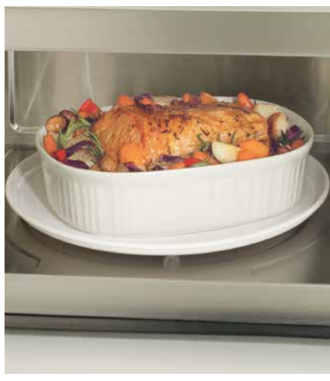
Optional utensils are metal or foil roasting pans, oven-glass baking dishes or Pyroceram® casseroles.