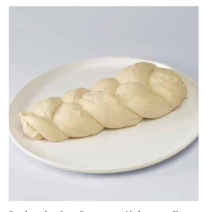
Braid or other shape. Remove turntable from oven. Shape bread; place directly on turntable. No preheating is needed. Bake for three-fourths of the time in your conventional recipe on LOW MIX.