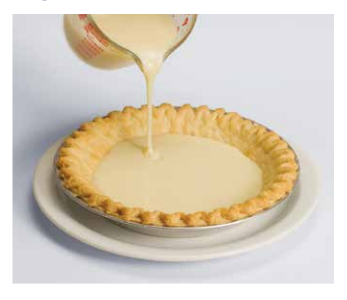
Custard Pies. Prebake and cool pie shell as directed on the left. Fill with uncooked custard. Without preheating, bake pie on round baking pan placed on low rack for 30 to 35 minutes on LOW MIX. If custard is not set, let stand in oven a few minutes to complete cooking.