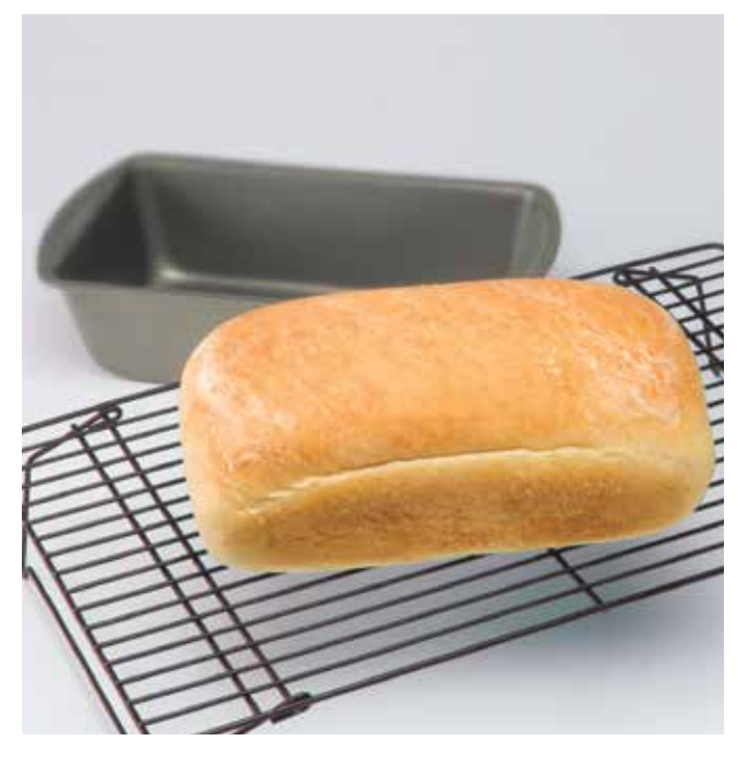
Preheating of oven is not necessary. Bake one loaf 25 minutes and two loaves 30 minutes at LOW MIX. After baking, bread should be golden brown and sound hollow when tapped. Do not let bread stand in oven; remove from pans immediately to cool on wire rack.