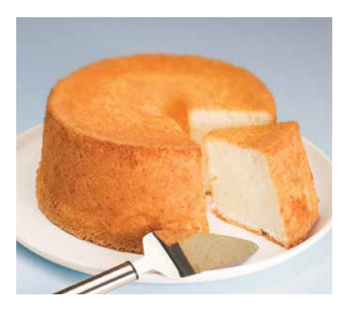
Angel Food. Do not preheat oven. Bake your recipe or a mix 25 to 30 minutes on LOW MIX or until crust is golden brown, firm and looks very dry.