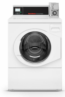
All models shown with Quantum® controls