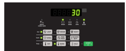
Quantum® Washer Control