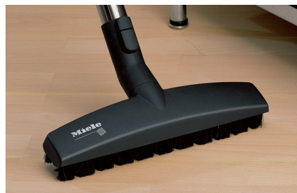
Parquet Floor Tool (Parquet-3)