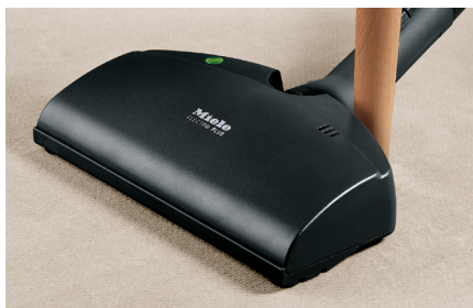
Electro Comfort (SEB 217-3)