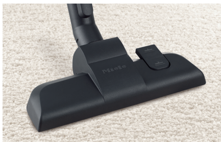
Classic Combination (SBD 350-3)