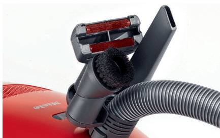
VarioClip™ with three accessories