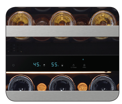
Dual Temperature Zone