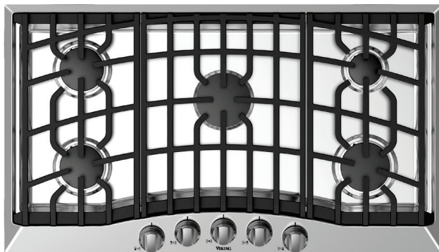
36" Wide Gas Cooktop