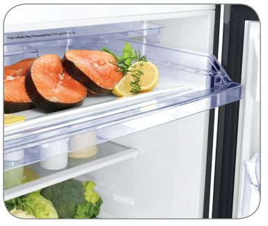
Slide & Reach Pantry