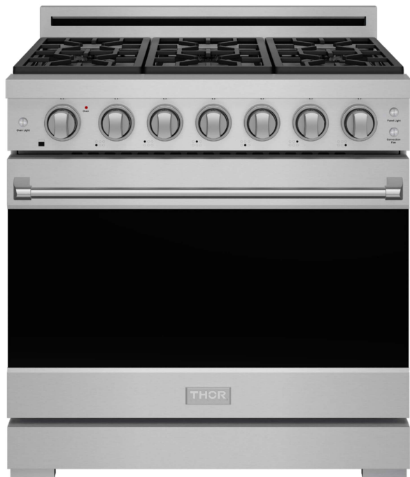
Product: 36 INCH PROFESSIONAL GAS RANGE IN STAINLESS STEEL Model Number: RSG36P