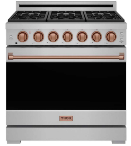
ROSE GOLD RSG36P-RSG