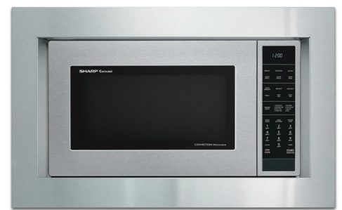
RK49S27F and RK49S30F RK56S27F and RK56S30F RK94S27F and RK94S30F