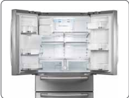
The innovative 33" wide 4-door refrigerator is perfect for smaller spaces and those that love to cook and entertain.