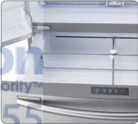
FlexZone Drawer with SmartDivider to help organization within the mid-drawer.