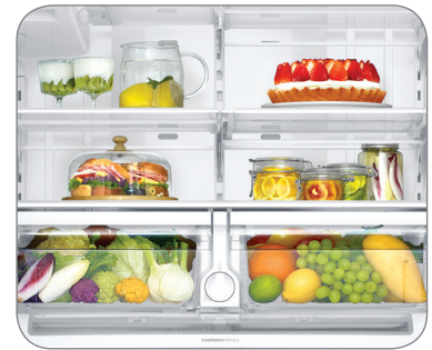
Cool Select Pantry™