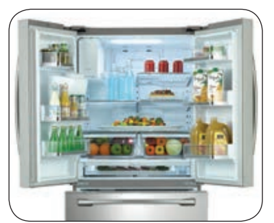
Ice Master Ice Maker