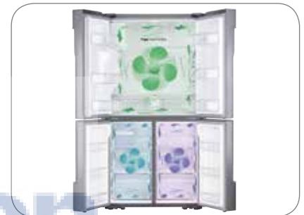
Triple Cooling System