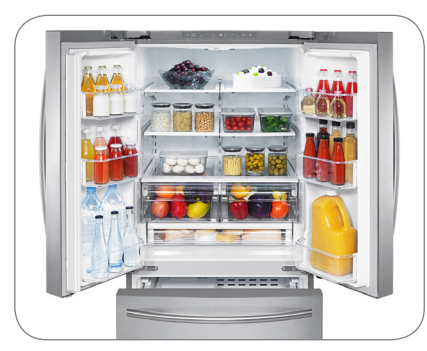
French Door Design