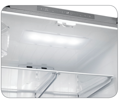
High-Efficiency LED Lighting