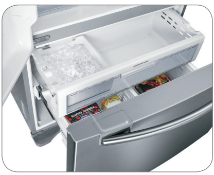
Automatic Filtered Ice Maker in the Freezer