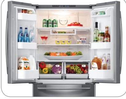
French Door Design