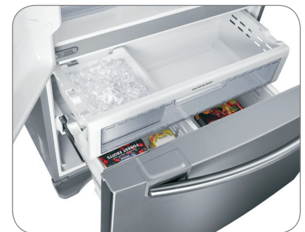
Automatic Filtered Ice Maker in Freezer (External Filter Not Included)