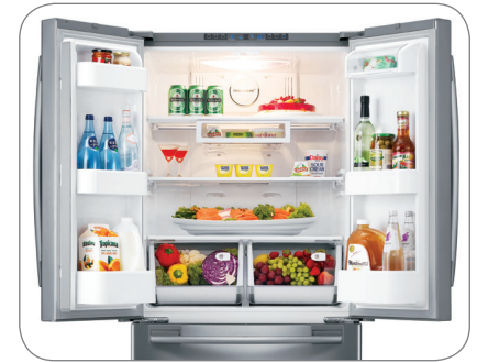
French Door Design