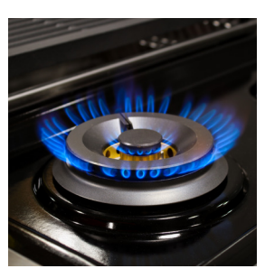
21,000 BTU Dual-Ring Burner

The American Range Vitesse Series Cooktop is designed to fit your kitchen countertop with style, power and the versatility of a professional range we are known for. We bring our expertise and decades of experience from manufacturing custom commercial cooking equipment into this stylish yet powerful industry leading dropin cooktop. Not only is it powerful, it also has amazing simmer capabilities. With sealed burners