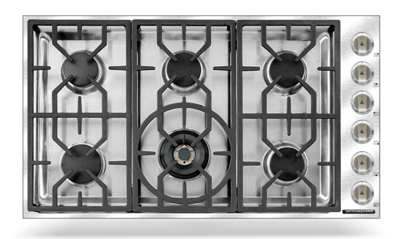
*ARDCT-366 Shown with Hand polished stainless steel finish. Other models available.