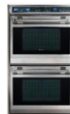
Model DO30F/S Framed Door Style

Accessories are available through your authorized Wolf dealer. For local dealer information, visit the find a showroom section of our website, wolfappliance.com .