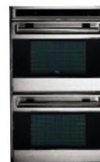
Model DO30U/S Unframed Door Style