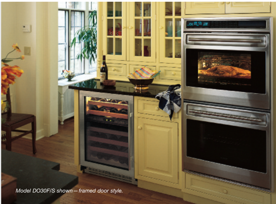
Model DO30F/S shown—framed door style.

Electronic controls hide behind a stainless steel panel. A motor quietly rotates the control panel into position. Both ovens of the Wolf L series built-in double oven feature the Wolf dual convection system. It delivers even temperature and airflow throughout the oven. Two fans and four heating elements operate either simultaneously or in sequence, depending on which one of the ten different cooking modes you choose.