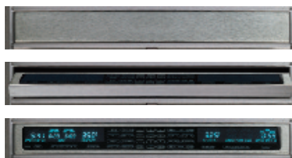
Rotating glass touch control panel.

This appliance is certified by Star-K to meet strict religious regulations in conjunction with specific instructions found on www.star-k.org .