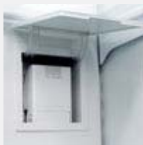
Air Purification System