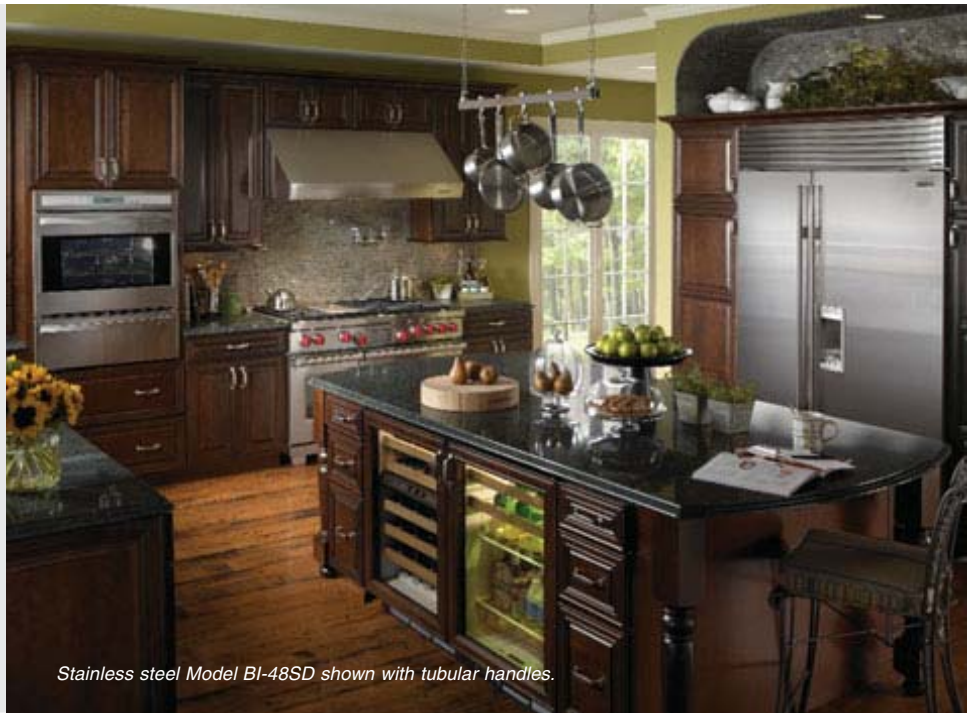
Stainless steel Model BI-48SD shown with tubular handles.

Side-by-side Model BI-48SD offers maximum refrigeration capacity along with an ice and water dispenser through the refrigerator door. Sub-Zero dual refrigeration along with new air purification and water filtration systems guard the freshness of your food and water like nothing before. Framed, overlay/flush inset and stainless steel models are available. New flush inset installation allows the unit to sit flush with surrounding cabinetry.