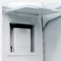
Air Purification System