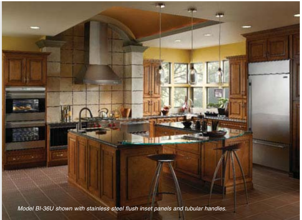
Model BI-36U shown with stainless steel flush inset panels and tubular handles.

Over-and-under Model BI-36U offers large refrigerated storage, plus a convenient roll-out freezer drawer. Sub-Zero dual refrigeration along with new air purification and water filtration systems guard the freshness of your food and water like nothing before. Framed, overlay/flush inset and stainless steel models are available. New flush inset installation allows the unit to sit flush with surrounding cabinetry. Model BI-36U/S is Energy Star qualified.