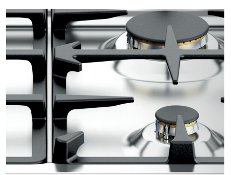
Cast iron pan supports of exclusive design allow sliding of cookware across the entire cooking surface. The stainless steel worktop is also seamless for easy cleaning and the sharpest look.