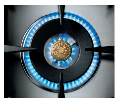
Bertazzoni's exclusive dual control power burner in cast brass delivers high-efficiency performance from delicate low simmer to full power (750 – 18,000 BTUs) with best-in-class heat-up time.