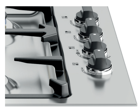
Bertazzoni low profile drop-in cooktops sit almost flush over the countertop and present a seamless edge all around. The design integrates beautifully with the Bertazzoni line of convection ovens, specialty ovens and warming drawers.